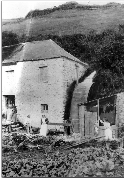
Left: Hele Mill water wheel, early 19th century.