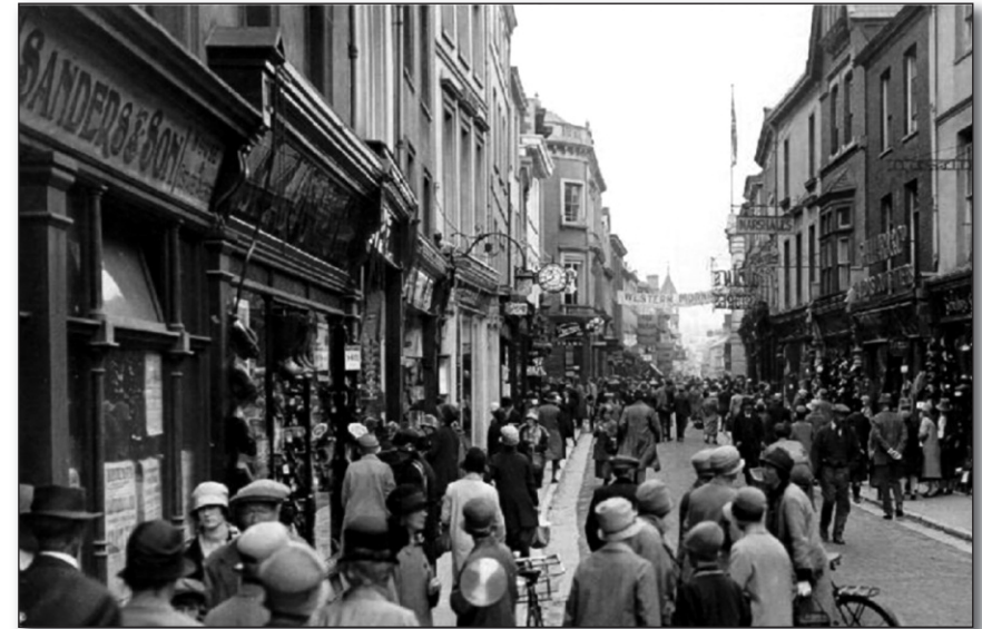
Barnstaple High Street, 1920s. Shows this town as it looked when Ron was a boy.